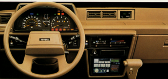
LE Van Full Instrumentation

**Requires dual air conditioning option.