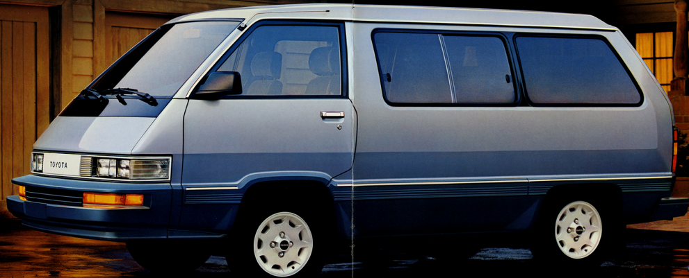
LE Van Shown in Light Blue Metallic Available Blue Metallic, Sun Lane

SLEEK STYLING AND LOADS OF PASSENGER AND CARGO ROOM MAKE THE PASSENGER VAN THE PERFECT VEHICLE FOR ON-THE-GO FAMILIES.