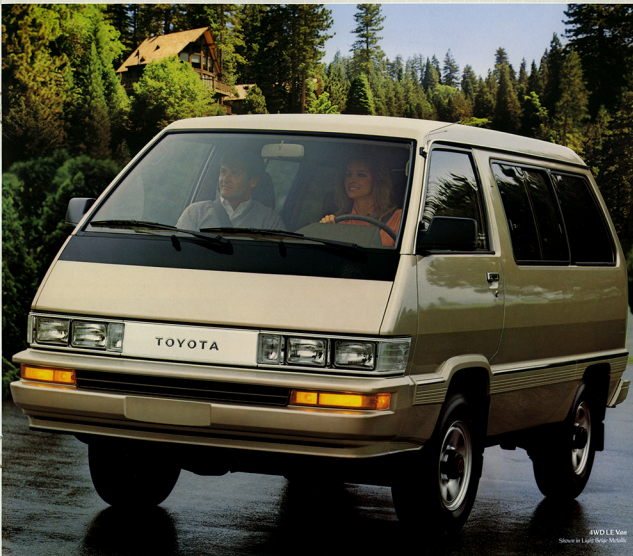
4WD LE Van Shown in Light Bronze Metallic